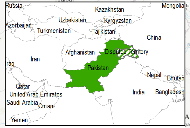
Pakistan and the Surrounding Region