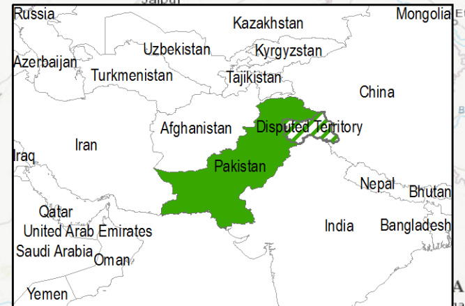
Pakistan and the Surrounding Region